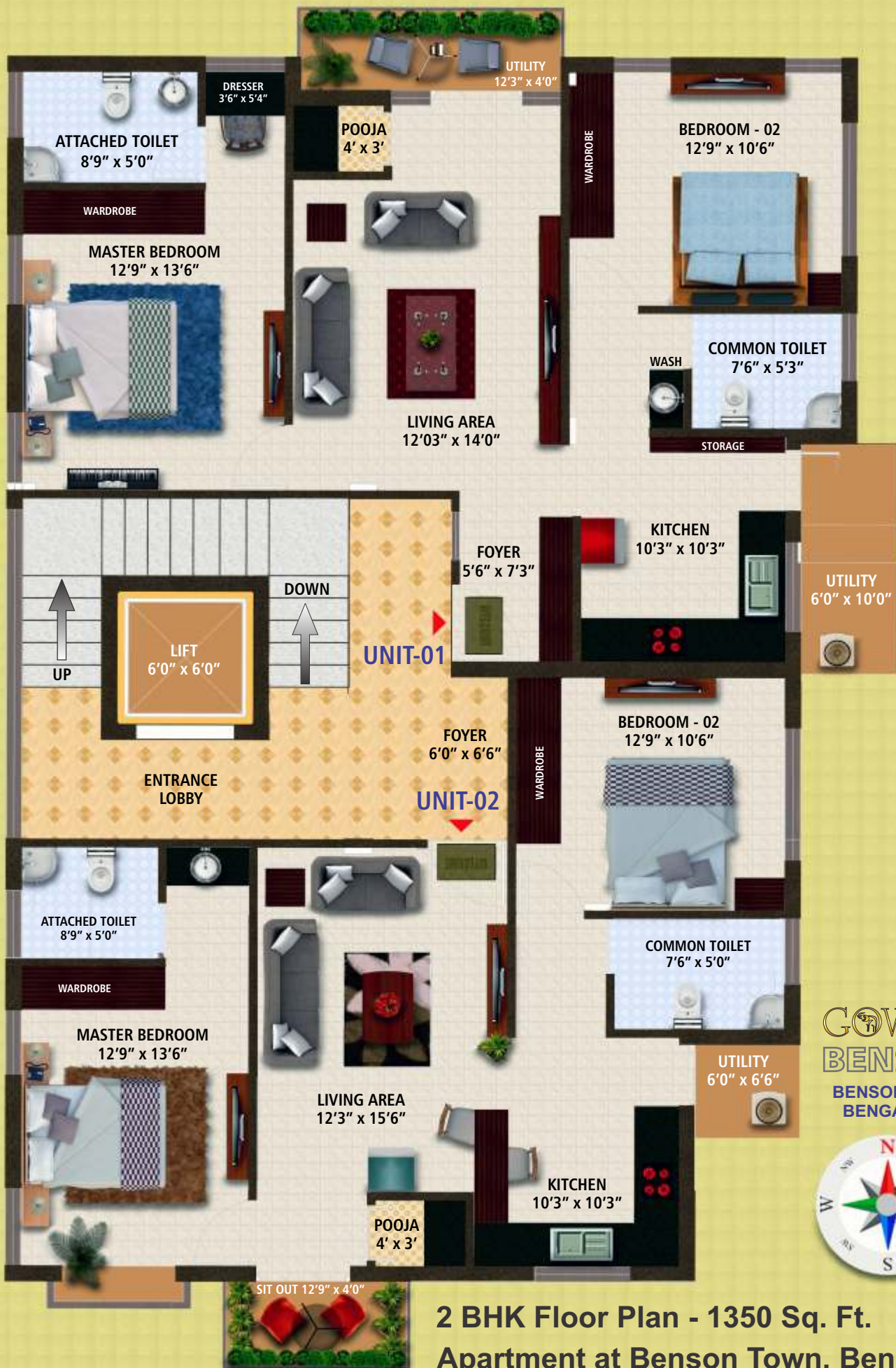
2 BHK Floor Plan - 1350 Sq. Ft. Apartment at Benson Town, Bengaluru