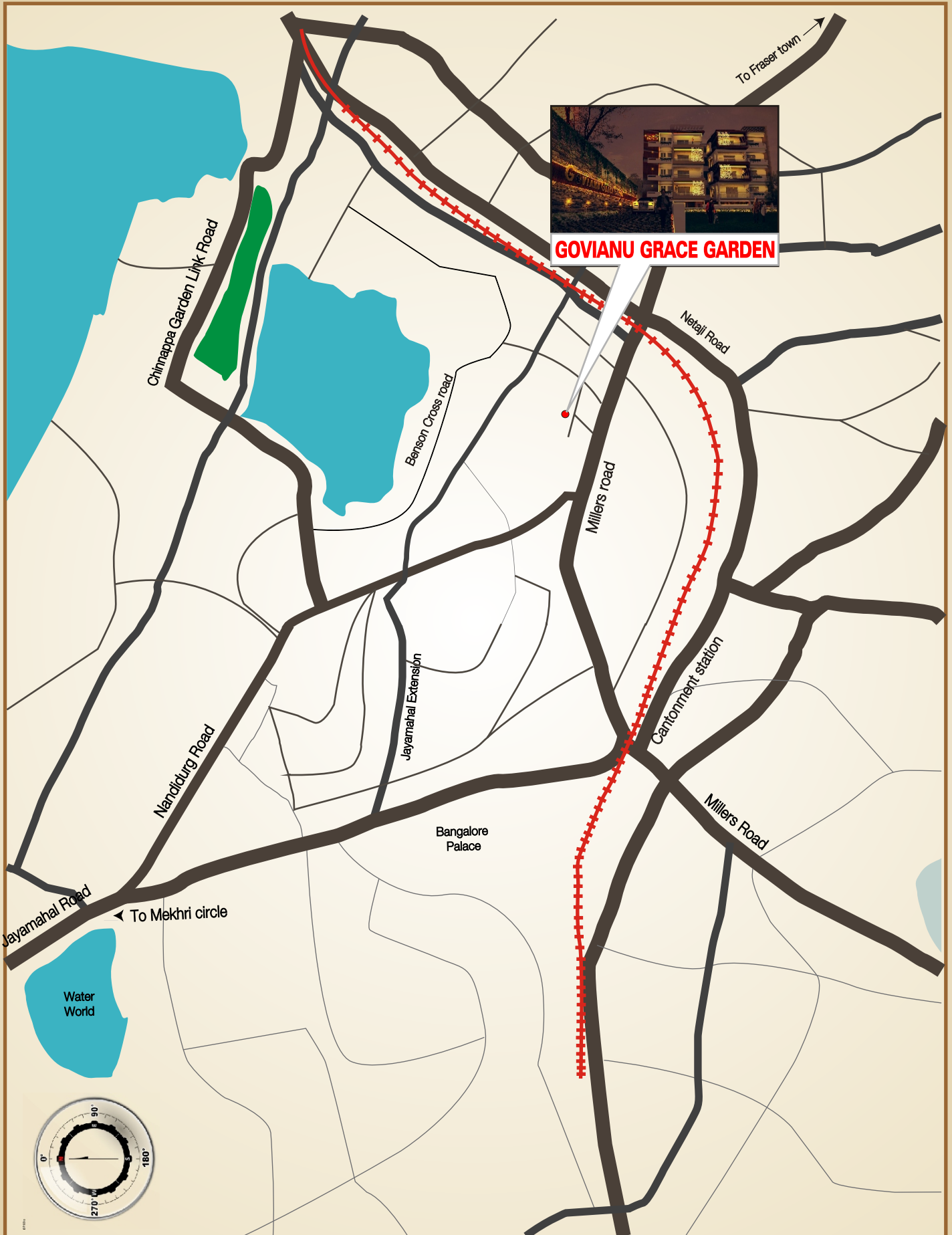
Route Map - How to Reach?