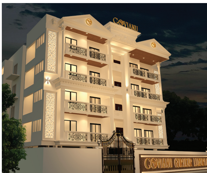
GOVIANU GURIKAR LUXURIA MYSURU