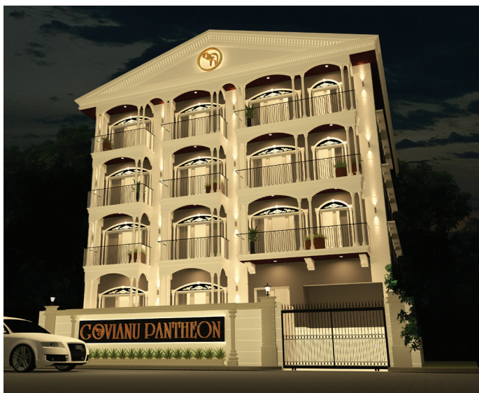
GOVIANU PANTHEON DOLLARS COLONY