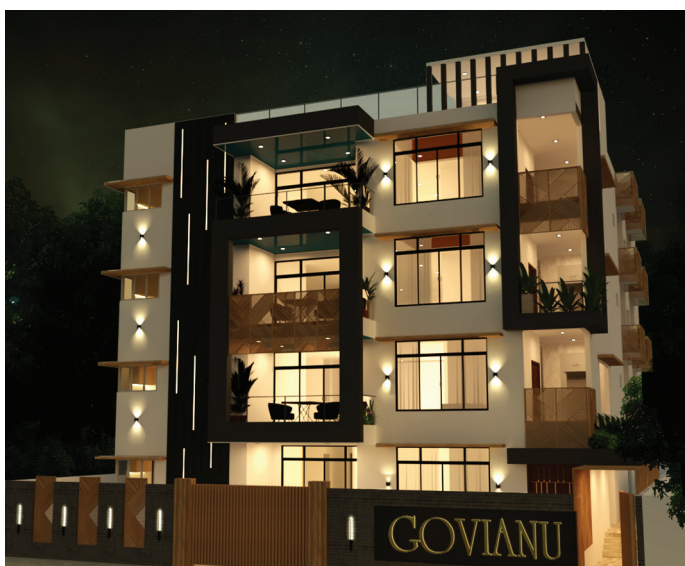
GOVIANU MADRE DIVINA JUDICIAL LAYOUT