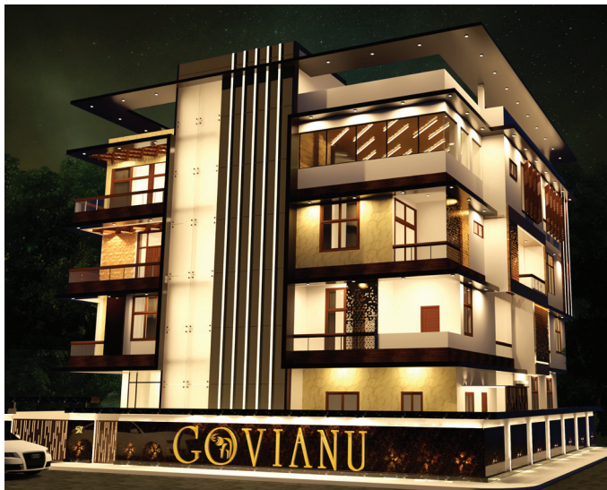
GOVIANU BOUGAINVILLA DOLLARS COLONY