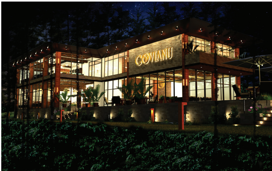
GOVIANU CHIKMAGULUR JOLDHAL, CHIKMAGULUR