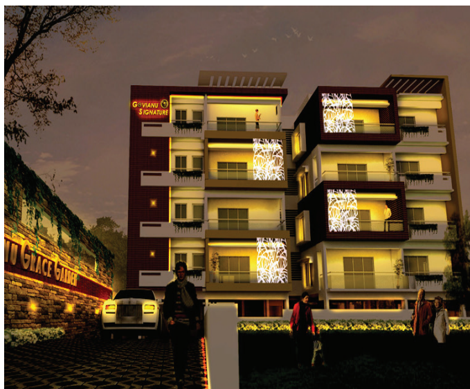
GOVIANU GRACE GARDEN BENSON TOWN