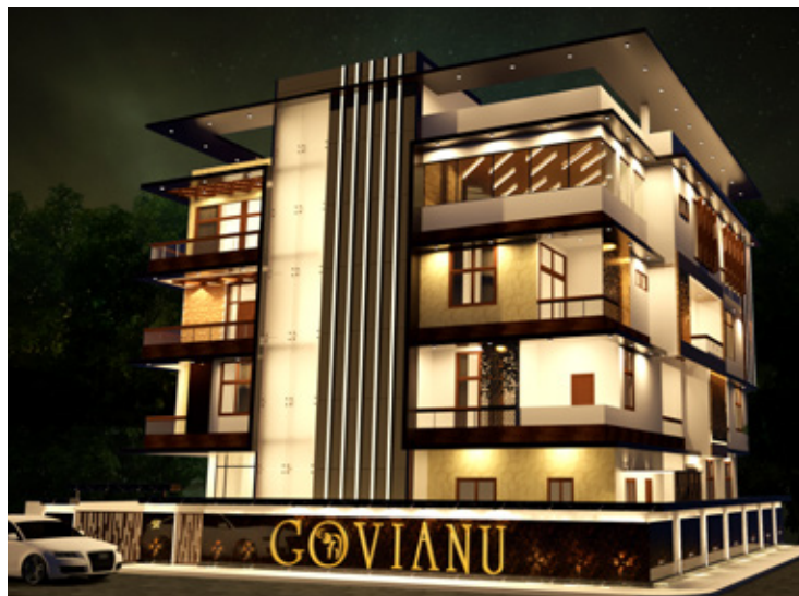
GOVIANU BOUGAINVILLA DOLLARS COLONY