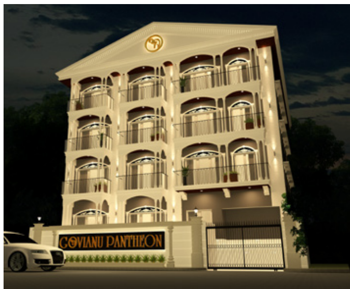
GOVIANU PANTHEON DOLLARS COLONY