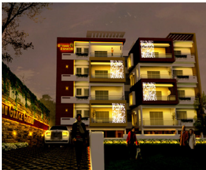
GOVIANU GRACE GARDEN BENSON TOWN