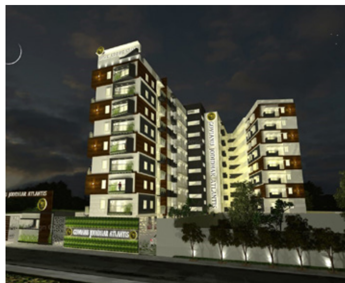
GOVIANU JODIDHAR ATLANTIS SAHAKARNAGAR