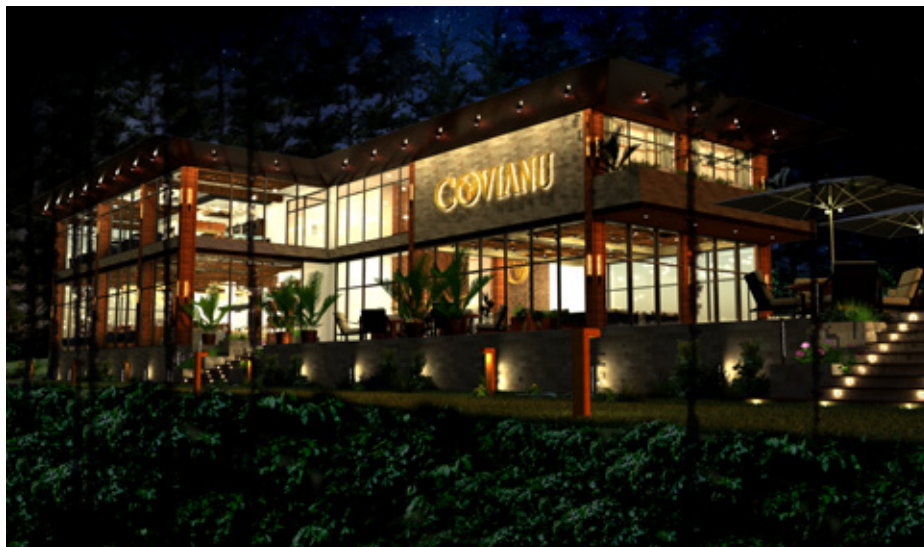
GOVIANU CHIKMAGULUR JOLDHAL, CHIKMAGULUR