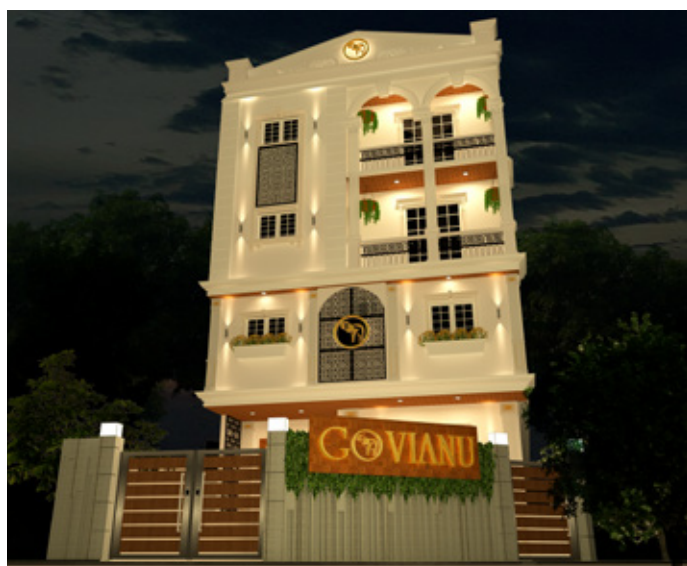
GOVIANU MARGOSA MALLESHWARAM